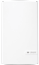
Expansion Unit TR1310

For any installation exceeding 15 A, use the expansion unit in addition to the thermostat.