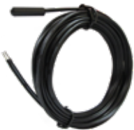
Floor Sensor AC1310-01

For any installation exceeding 15 A, use the expansion unit in addition to the thermostat.